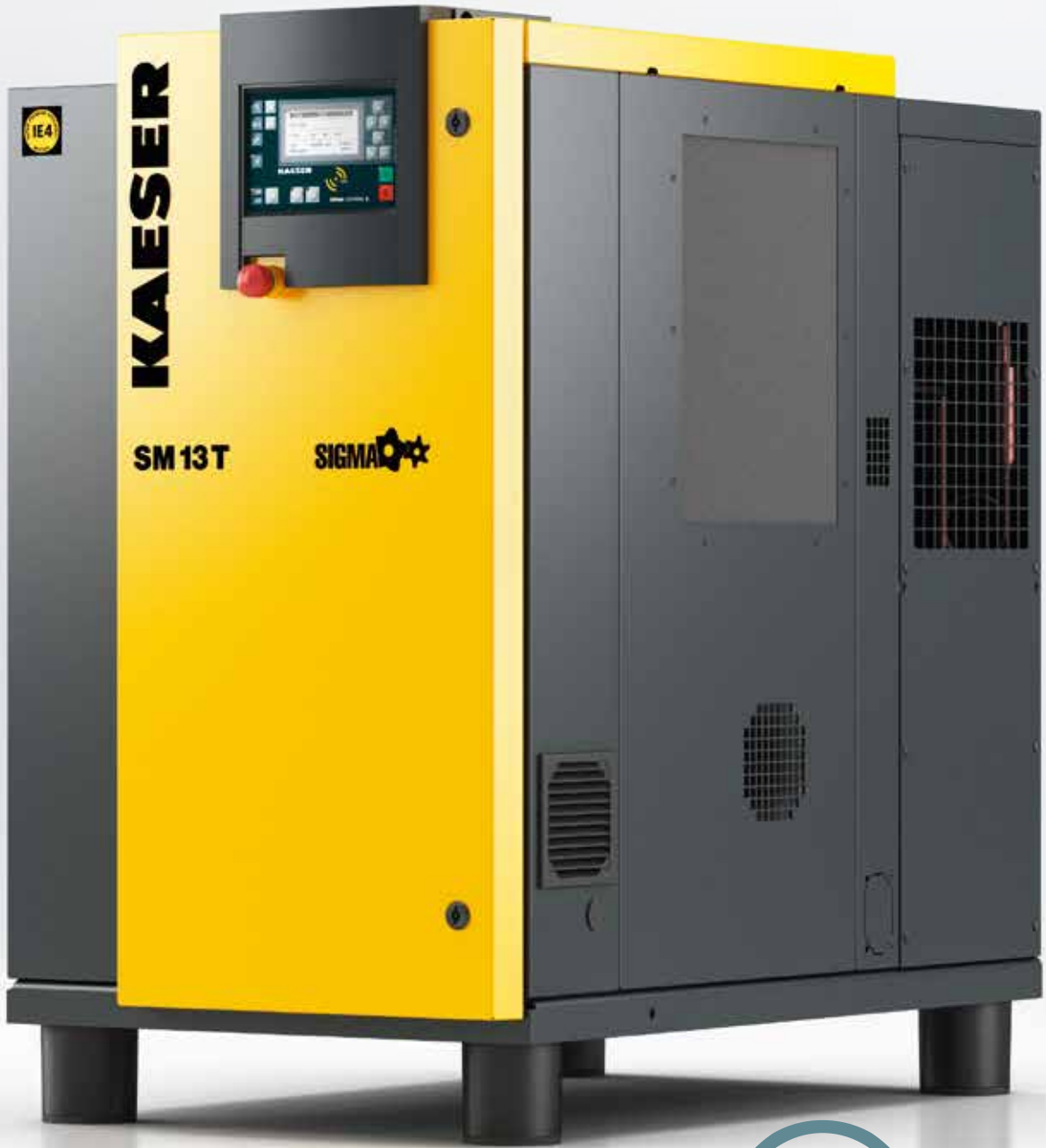
Image: SM 13 T

All maintenance work can be carried out from one side of the unit. The left housing cover is easily removed to allow excellent component accessibility.