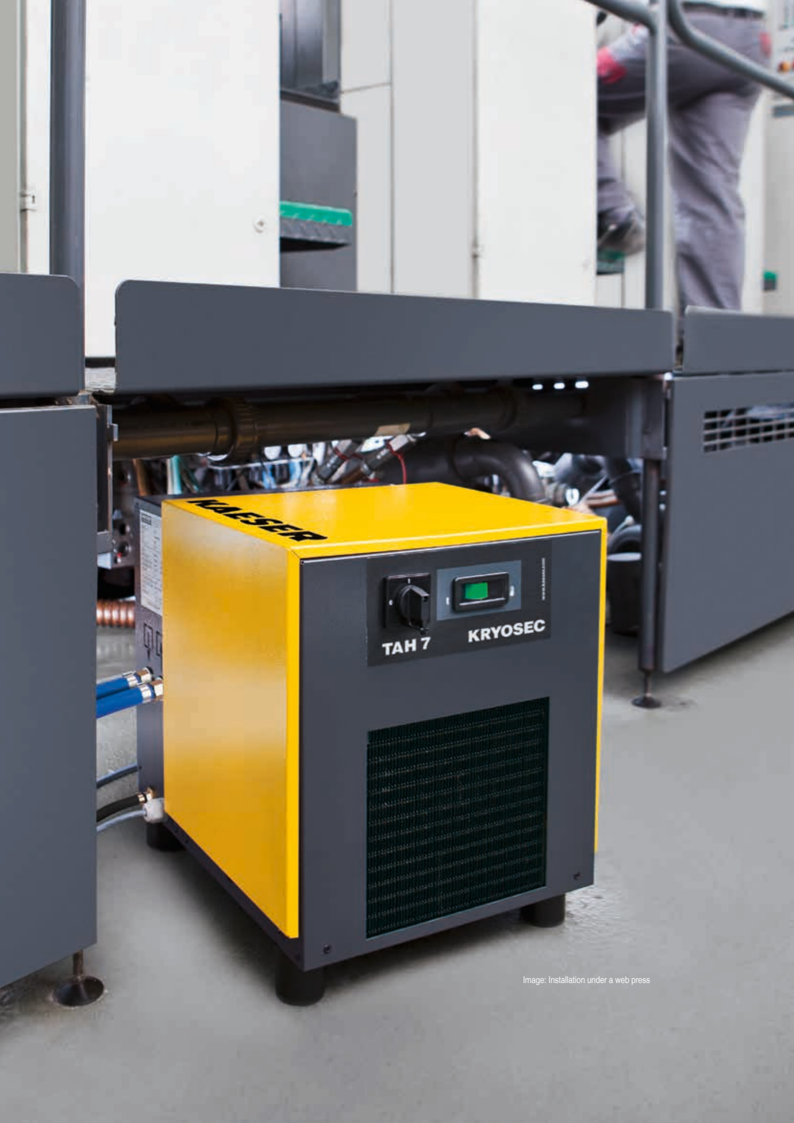
Image: Installation under a web press