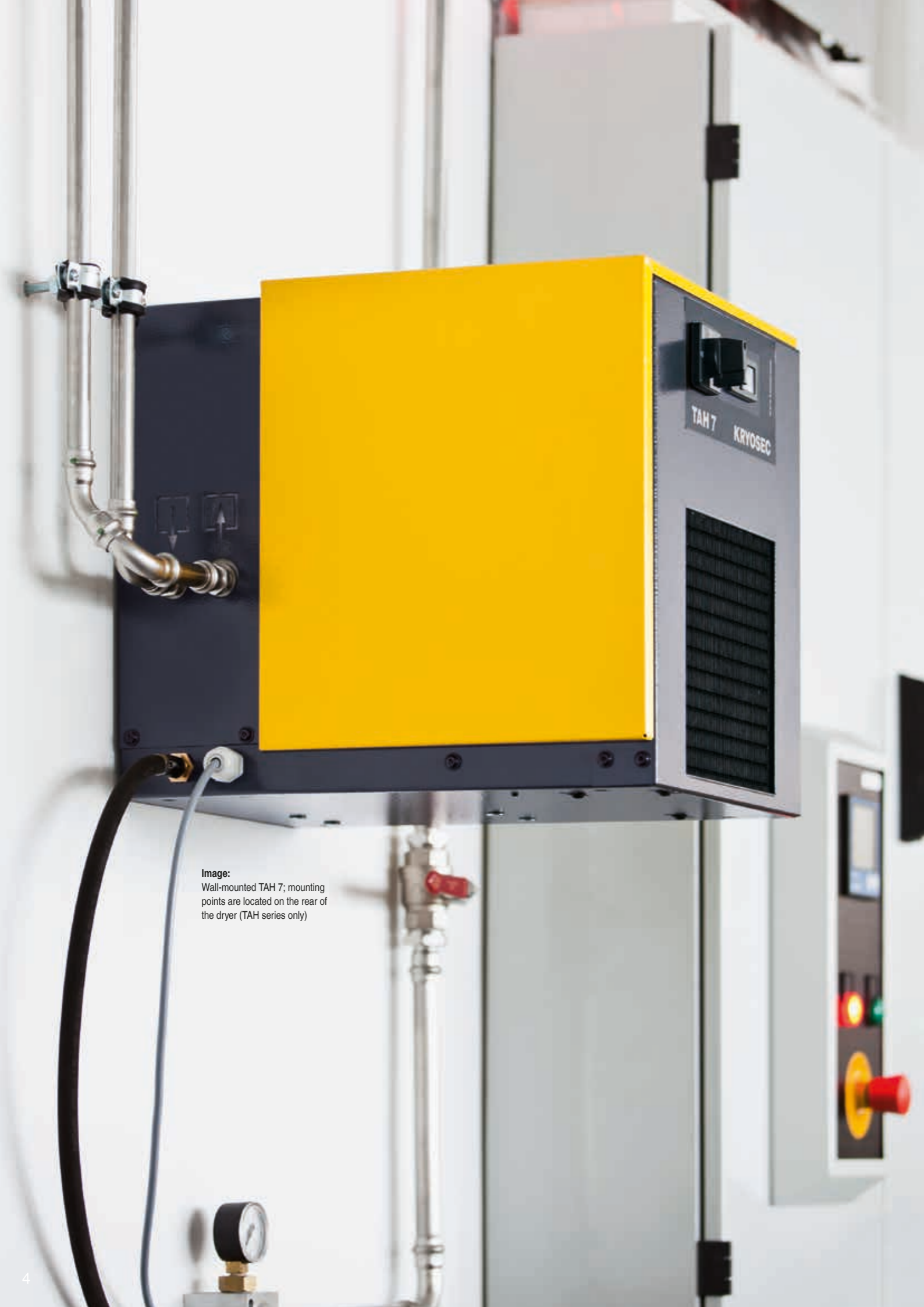
Image: Wall-mounted TAH 7; mounting points are located on the rear of the dryer (TAH series only)