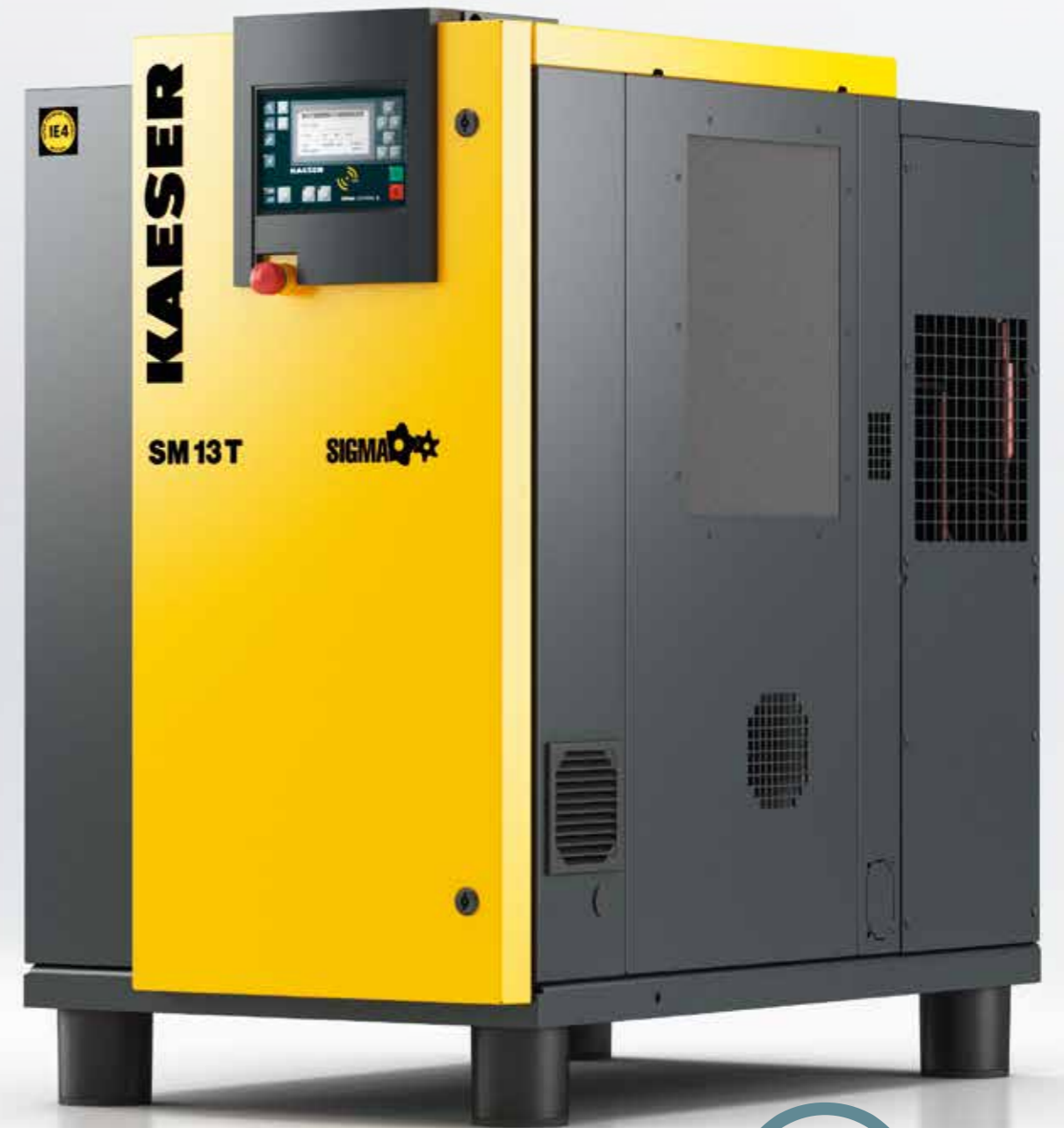
Image: SM 13 T

All maintenance work can be carried out from one side of the unit. The left housing cover is easily removed to allow excellent component accessibility.