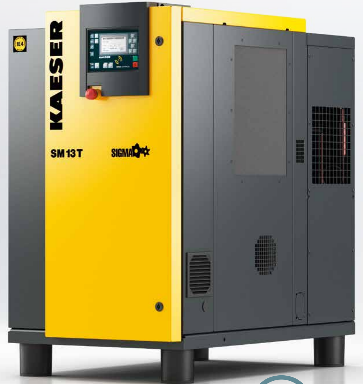
Image: SM 13 T

All maintenance work can be carried out from one side of the unit. The left housing cover is easily removed to allow excellent component accessibility.