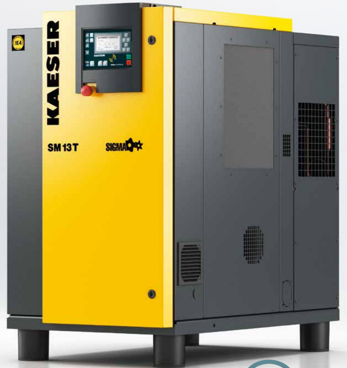
Image: SM 13 T

All maintenance work can be carried out from one side of the unit. The left housing cover is easily removed to allow excellent component accessibility.