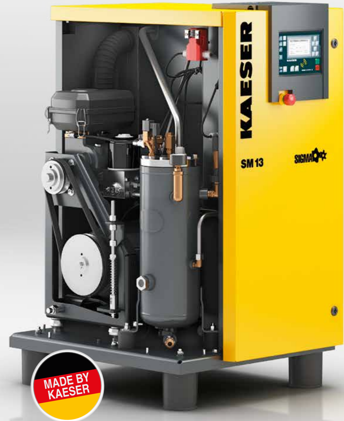
Image: SM 13