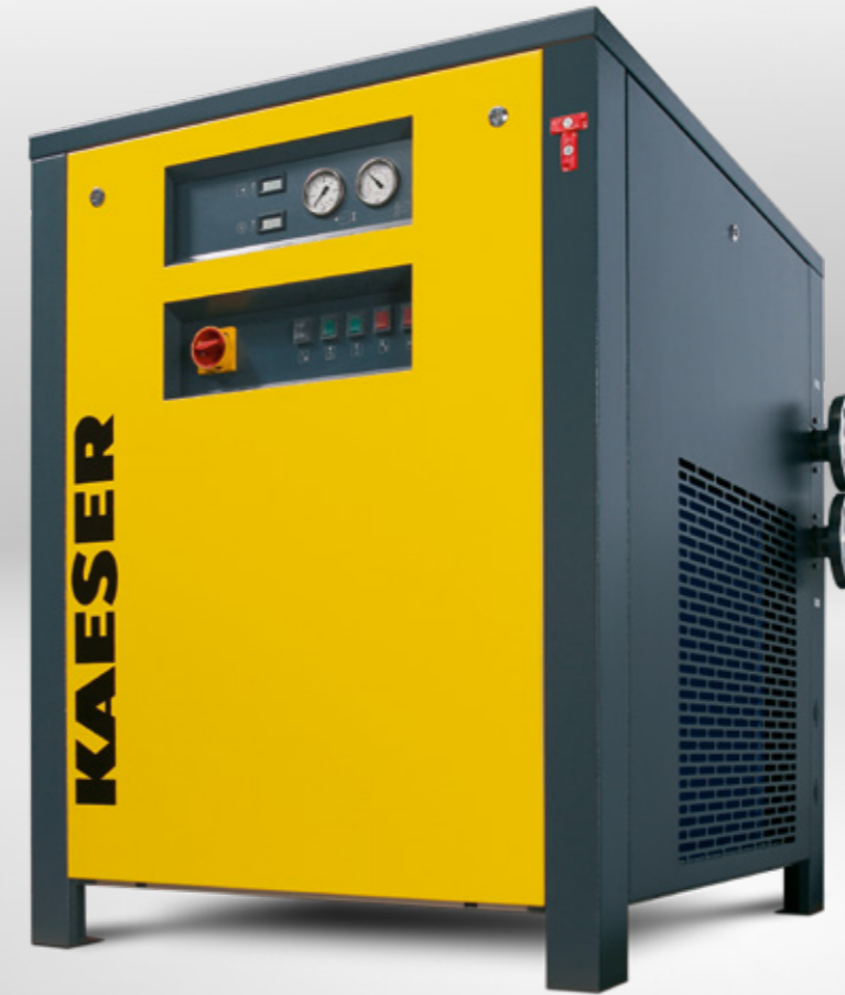
Standard version THP 40-50